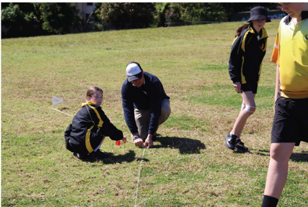
Year 7 and 8 Students performing triangulation using string and markers