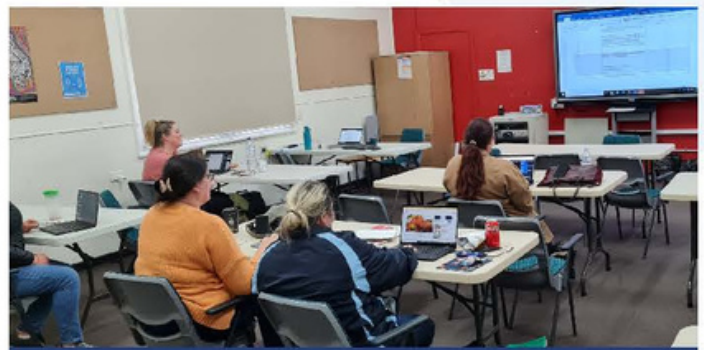
Teachers from four primary schools working with the RASE project officers to develop units of work

RASE project officers continue to work with staff from our primary schools to develop innovative units of work that embed Design Thinking and Technology to assist students develop their problem solving skills. Teachers and students alike are always telling us how much they enjoy the units, which is leading to increased student engagement in classrooms.