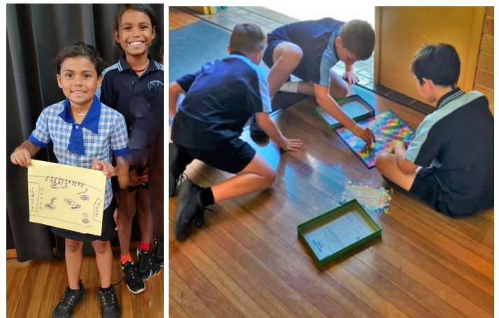
Students testing and prototyping games.

This term, students in years 3 and 4 have been studying a unit about forces. As part of this unit, they have been challenged to create an indoor game for children their age that makes use of at least one force. Students had a full-day workshop with the RASE Project Officers to brainstorm ideas, then plan and prototype their solutions.