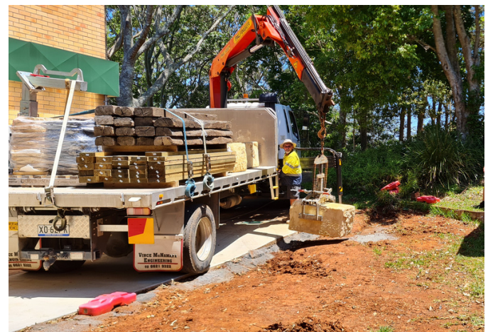
Above: materials being delivered Left: benches and gardens built by the students