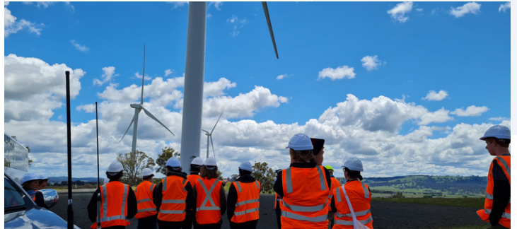
The wind turbines at white Rock Wind Farm are huge!