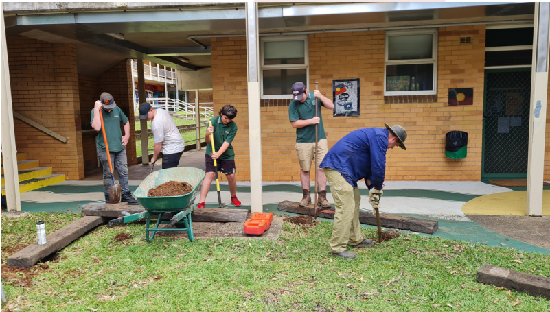
The boys work hard to dig holes for the installations of benches

Students at Kadina High have been working hard to make the vision of a Student Enterprise Hub a reality. With funding support from Schools Plus, the Student Enterprise Hub will be a space available to all students for a range of enterprise activities such as year 12 fundraising for their formal, SRC fundraising events, and a range of other entrepreneurship activities. The design of the space aims to be representative and inclusive of our diverse community, being a welcoming place for visitors at events such as orientation days. Work is continuing with artwork on the outside of the container planned as well as an internal fit-out