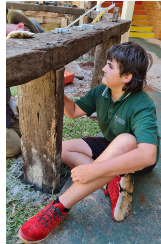
Dean securing the top of the bench to the legs