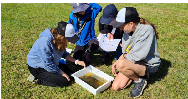
Water quality activity at Bingara Living Classroom