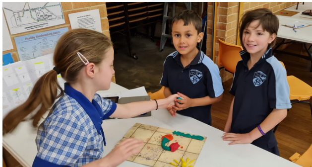
Students using play dough to create models for their stop-motion animation.