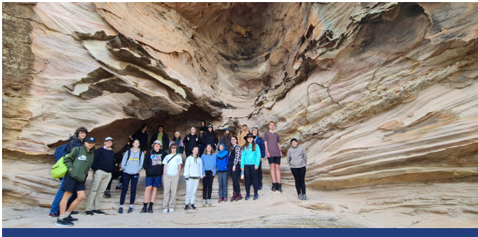
Sandstone Caves, Pilliga Nature Reserve

This excursion was organised by RASE for the three high schools in our academy. Students who had participated in RASE activities throughout the year were invited to submit an EOI. Some of these activities included drone workshops, bottle rocket challenge, STEM design thinking workshops, and STEM activities at the stage 4 gala day. The excursion was funded through a grant from the Children and Young People Wellbeing Recovery Initiative, a contribution from Rural Industry Education Partnership (RIEP), RASE and a contribution from each student.