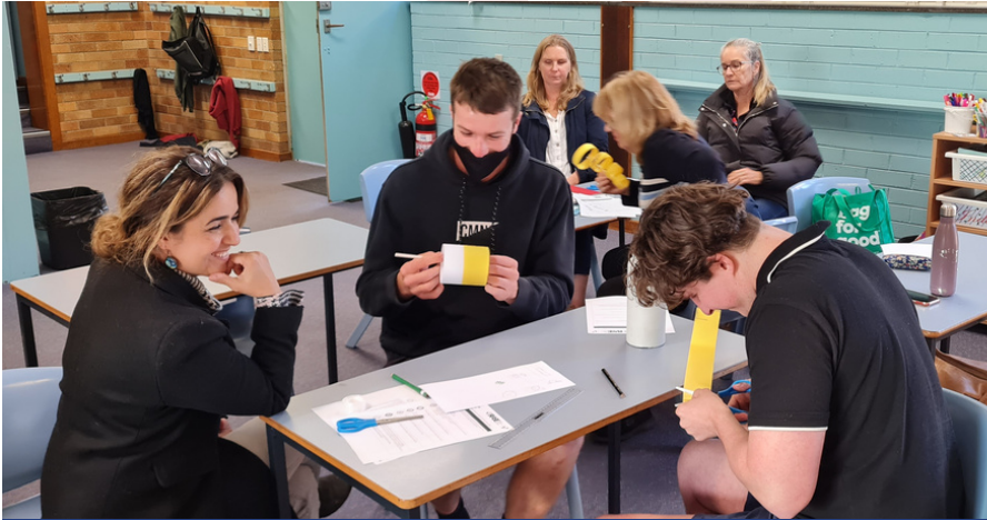
Staff participating in a mini-STEM challenge

Staff at Goonellabah Public School have been working closely with RASE STEM Project Officers to develop units of work that embed the Design Thinking Process and technology into their teaching and learning programs. This has been achieved through staff meetings and collaborative planning days across the whole school